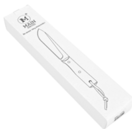
Survival knife box