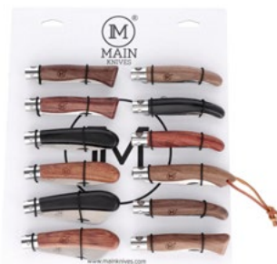
Wall expositor for 12 units